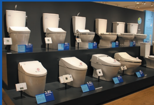
Organized display of the development history of TOTO products, such as ceramic sanitary ware and faucets.