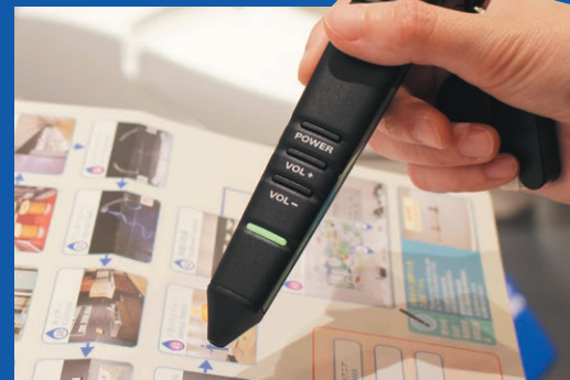
Free audio description service with 'Audio Pen' in English, Japanese, Chinese and Korean.

* As number of Audio Pen is limited, lending may not be possible.