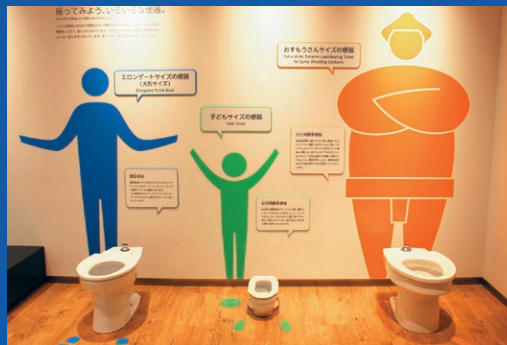
You can even sit on some exhibits and experience the feel.