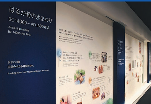
Showcasing the history of plumbing from ancient era until today.

TOTO was established in 'Kokura', Kitakyushu in 1917. At a time when most of Japan was still without sewers, TOTO started with the will of bringing healthy, cultured lifestyles to the Japanese people. Enjoy tracing the development of Japanese lifestyle, featuring abundant plumbing-related materials including toilets.