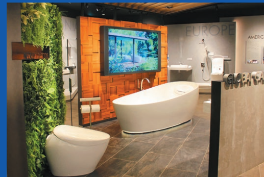
Products marketed all over the world including Asia, the Americas, and Europe, are on display.