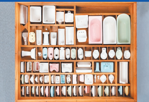
You can see unique exhibits such as miniature samples used when there were no showrooms.